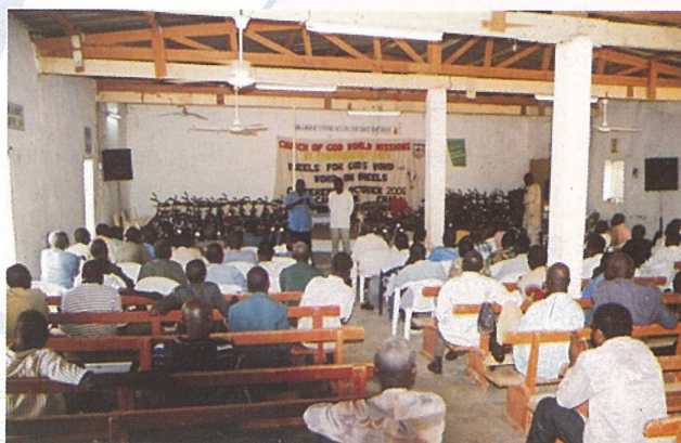
Training conference in Chad