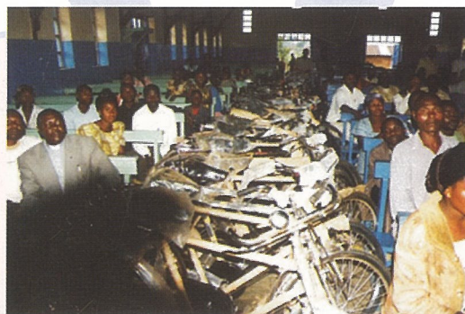
Bicycles for pastors and evangelists in the DRC