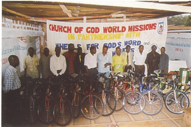
Bicycles for proclaiming the Gospel in CAR

I am grateful for whatever you have done here in the DRC in preaching the Gospel to the Pygmies, also for your physical, spiritual, and even your material and financial support.