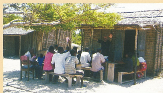
Church service in Port