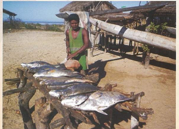
Fish drying table