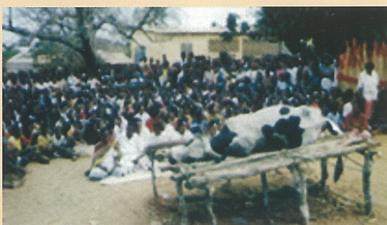
Sacrifice to the forefathers